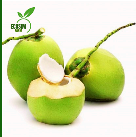
Fresh Green coconut