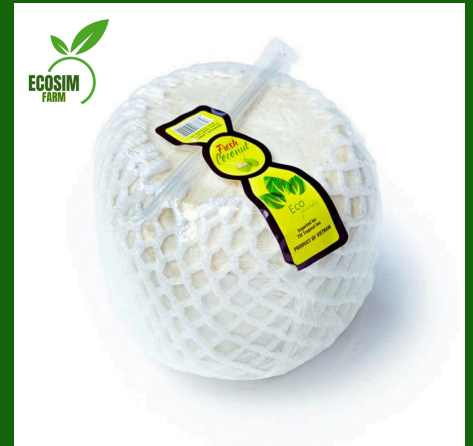
Coconut with straw